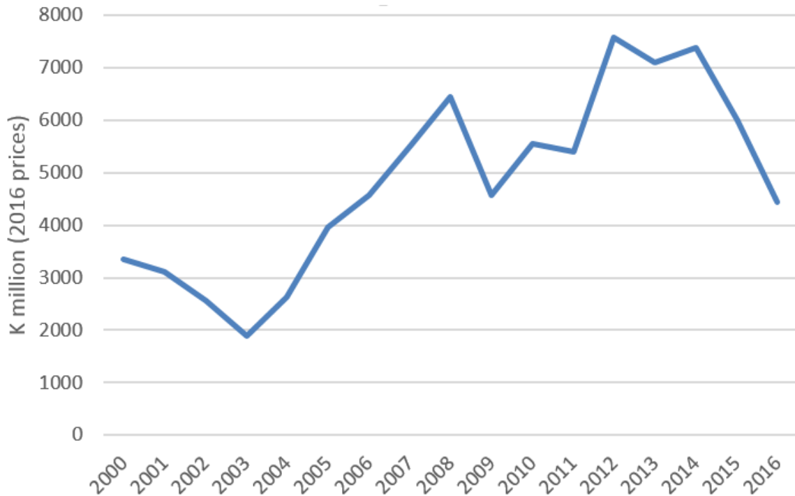
Figure 1: Discretionary expenditure, adjusted for inflation

Note: Discretionary spending is total spending minus spending on salaries, interest, MP funds, and the education subsidy. Values in this figure and the next are actuals, except for 2016 which uses estimates.