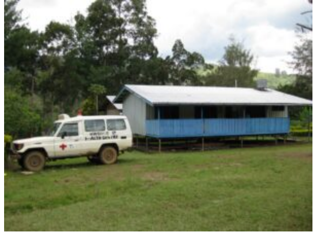
Kwongi Health Centre in Eastern Highlands, PNG

The Papua New Guinea Department of Health collects routine health information through its National Health Information System (NHIS; now often referred to as eNHIS). The system is set up to gather highly and ever-more detailed monthly reports from over 800 health facilities (sub-health centres and higher) on a wide variety of conditions. In some provinces, data entry on tablets has now been introduced at the health facility level with the aim to improve the timeliness and accuracy of health statistics.