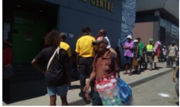
People queueing at the Nasfund Office to apply for unemployment benefits

There is no doubt COVID-19 is causing great economic damage all round the world, and Papua New Guinea is no exception. One estimate from the PNG Trade Union Congress is that more than 10,000 jobs in the private sector have been lost due to the pandemic and the subsequent state of emergency. Nambawan Super has recently indicated that unemployment claims are up by 25% in May and June.