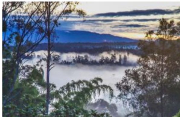
Komo Valley, Papua New Guinea

Hela Province, in the Papua New Guinea Highlands, is the site of extraordinary levels of armed conflict, which is a problem that has become progressively worse over the past several years. In February 2023, Hela made international headlines when an Australian archaeologist and members of his research team were kidnapped and held for ransom by a gang from Komo in the southern part of the province.