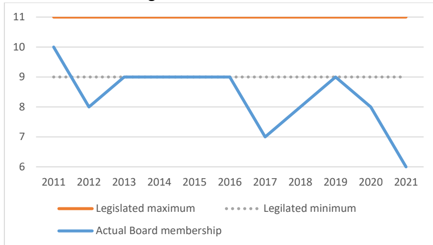
Figure 1. BPNG Board size