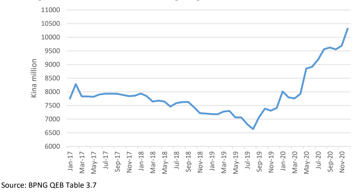
Figure 23. Commercial bank holdings of government securities, 2017 to 2020

Not all of this increase would have been due to the reduction of the CRR, but it would have helped. Negative domestic borrowing in 2018 (when PNG secured a large commercial foreign loan) also helped create room for additional domestic lending to government in 2020.