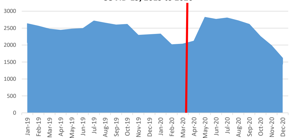
Figure 20. Central bank holdings of government debt (Kina millions): before and during COVID-19, 2019 to 2020

With the onset of the COVID-19 pandemic, BPNG <u>announced</u> on 30 March 2020 that it would engage in the purchase of government securities (or QE) to inject liquidity. It did initially, but then, as the graph below shows, a few months later started selling government securities. As the figure also shows, the Bank in fact held less government debt at the end of 2020 than it did at the start of the pandemic. As discussed in <u>Chapter 3.1</u>, the sale of securities in the second half of the year was due to the Bank's concerns that the increase in the TAF would increase liquidity. However, again as discussed there, in fact Treasury has made little use of the TAF, at least up to the end of 2020. Moreover, other decisions made by BPNG in response to COVID-19 were designed to inject liquidity: not only the QE program, but a reduction in the Cash Reserve Requirement from 10% to 7%, and a cut in the Kina Facility Rate (KFR) from 5% to 3%.