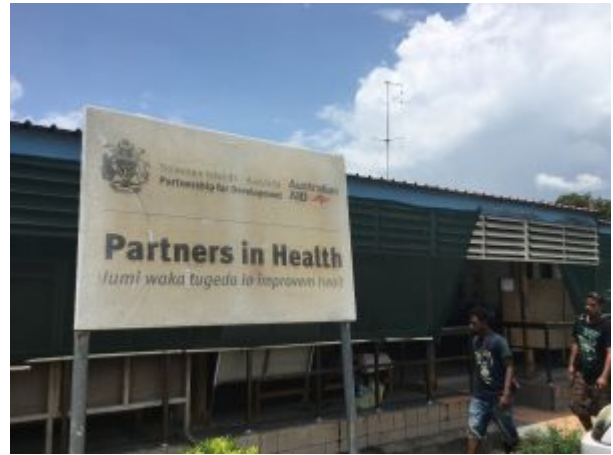
Australian aid sign at the National Referral Hospital, Honiara

The burden of malaria in Solomon Islands remains among the highest of all countries outside of sub-Saharan Africa. But significant improvements in malaria control have been made over the last 25 years. From a peak of nearly 450 new cases per 1,000 population in 1993, by 2016 annual national malaria incidence had dropped to 81 (Figure 1).