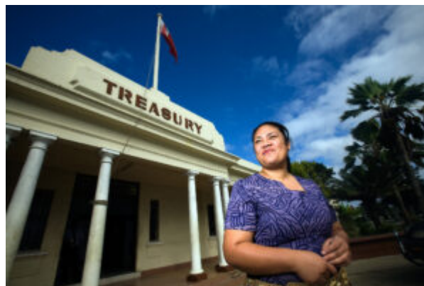
Tongan public servant, Nuku'alofa