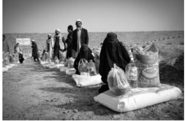
Humanitarian aid in Kunduz