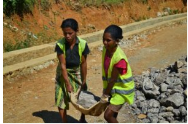
Women work on the Road for Development Programme in Timor-Leste; the improved road access for rural Timorese will hopefully bring economic benefits

Recent data show the surprise finding that remittances are Timor-Leste’s largest source of foreign revenue after oil and aid. More than USD 40 million was remitted to Timor-Leste in 2017, made up of over 85,000 individual payments. This means that labour services is Timor-Leste’s major export, more important than coffee exports (between USD 10 and 20 million a year) or revenue from tourism (estimated at USD 14 million in 2014).