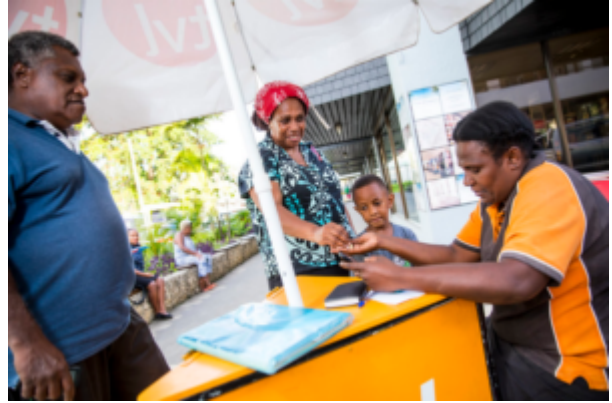
Mobile money service in Vanuatu

For many centuries humans have been travelling the globe and with these travels has come the need to move money safely, cheaply and efficiently. Today, there are many people who move abroad in search of better work opportunities and the means to support family members back home. These migrants require a reliable, affordable and convenient channel to send the money they earn in the country of employment home to their families. In financial services industry parlance, this is a 'remittance'.