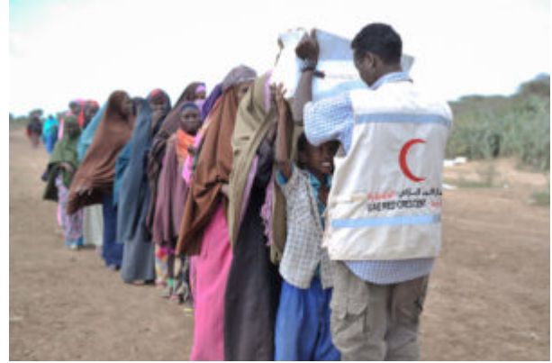
Boy receives a box of food from UAE Red Crescent in Afgoye, Somalia

In 1960, the world had 20 states providing foreign aid to developing countries. In 2014, this number more than doubled to 48 official donors, which is an underestimate as it doesn't include donors like India, China and Brazil that do not report to the Development Assistance Committee (DAC).