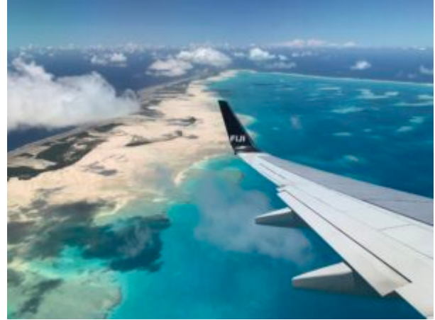
Aerial view of Tarawa, Kiribati

When New Zealand closed its international border on 19 March 2020 following the onset of the COVID-19 pandemic, over 10,000 Pacific seasonal workers were in the country under the Recognised Seasonal Employer (RSE) scheme. Over the past year, one of the most significant and complex aspects of the RSE scheme's operation has been the repatriation of Pacific RSE workers who have sought to return home. The repatriation efforts which began in late June 2020, have been led by New Zealand's Ministry of Foreign Affairs and Trade (MFAT) in close collaboration with horticulture industry groups and Pacific officials.