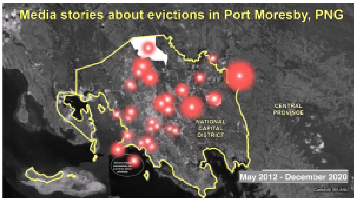
Figure 1: Cumulative number of media eviction stories (May 2012 to December 2020)

A cumulative mapping of these media reports over this decade gives a sense of the approximate locations of threats of evictions and actual evictions, and the media attention paid to these events (Figure 1; larger circles indicate more media reports mentioning that location). Some cases were the subject of multiple media stories, for various reasons. For example, some were the subject of ongoing court cases, while others involved public controversy with different perspectives being reported.