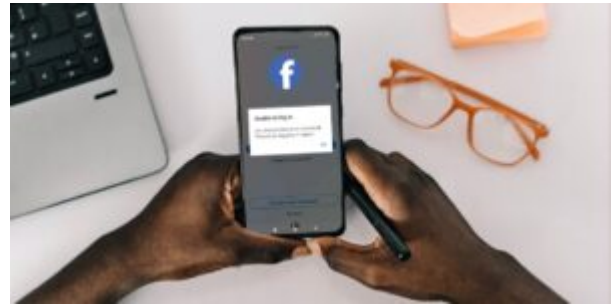
Facebook error on mobile phone