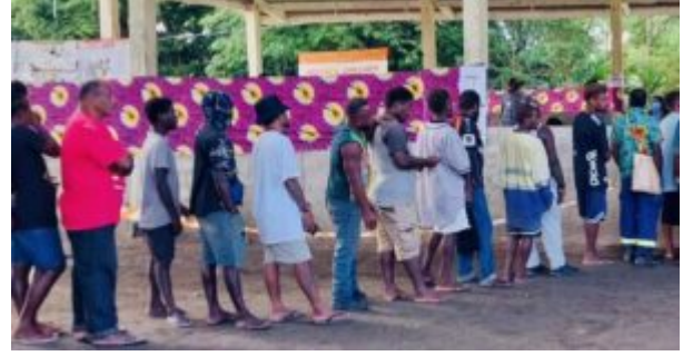
Voting in the 2024 Elections