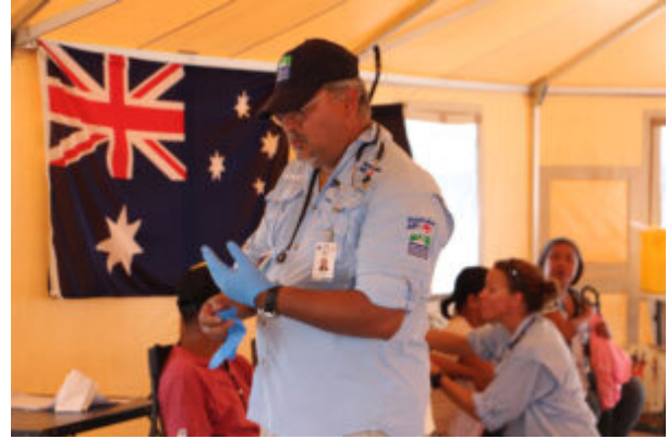
AusMAT medical facility in Tacloban following Typhoon Haiyan in Philippines in 2013

In setting out the Australian government’s aid budget for 2018/2019, the Minister for Foreign Affairs, Julie Bishop, and the Minister for International Development and the Pacific, Concetta Fierravanti-Wells, wrote: “Our region is home to 40 % of natural disasters and 84 % of people affected by natural disasters worldwide. Our development program is one of the ways Australia can respond to these pressures. In this context, the development program is more important for Australia than it has ever been.”