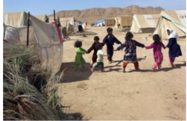
A camp for internally displaced persons in northern Afghanistan