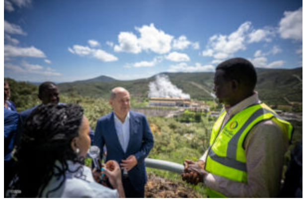
German Chancellor Olaf Scholz visits Africa's largest geothermal plant in Olkaria, Kenya