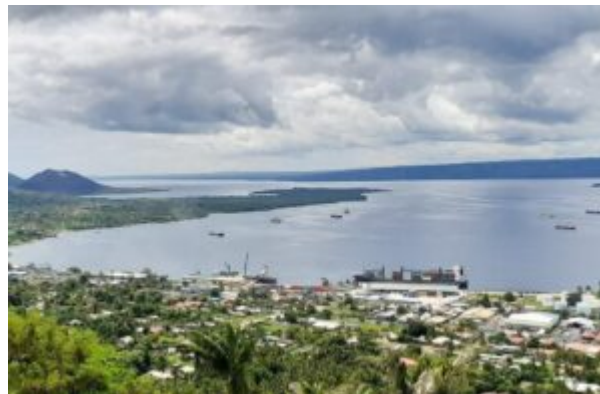
Rabaul Harbour, East New Britain

In this third post in a three-part series focusing on subnational government financing in PNG, I look at governance arrangements for provinces, districts and local-level governments (LLGs).