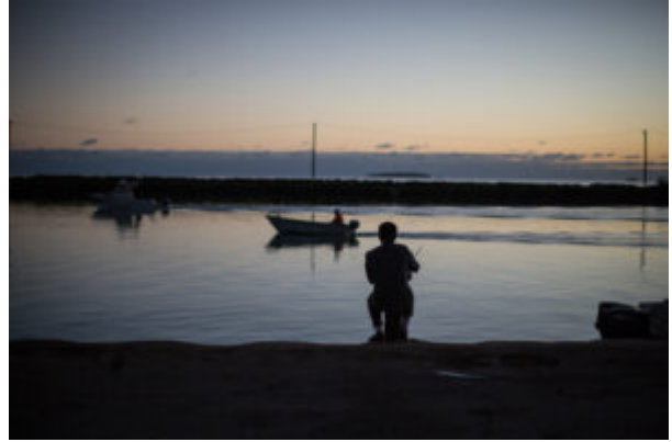
Fishing in Nuku'alofa, Tonga

As noted in my previous blog , since the restart of Australia's Seasonal Worker Programme (SWP) and Pacific Labour Scheme (PLS) in September 2020, some 6,798 SWP workers and 2,731 PLS workers have arrived to end July 2021.