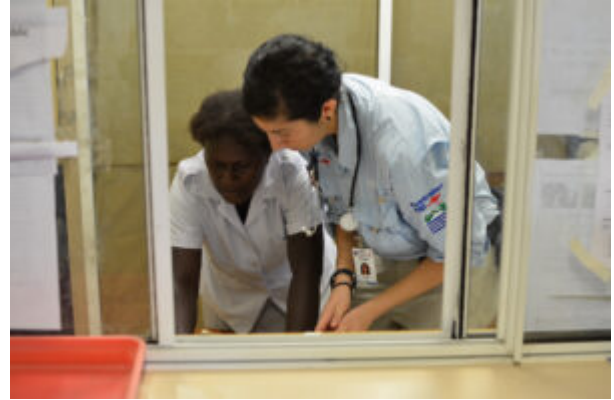
Dengue Taskforce from Australia in Solomon Islands

Bilateral and regional relations between countries have long been the bedrock of international diplomacy and aid programs, including Australia’s. But in recent decades, global forces operating outside traditional bilateral and regional frameworks have come into play: globalisation of trade and supply chains, large-scale migration, increased access to the internet and low-cost mobile phones, cashless payment apps for those with limited access to banks or transport ( two-thirds of the world’s mobile money accounts are now in Africa ). All these have been transformative, lifting millions of people out of poverty, but they also require new development policy approaches and thinking.