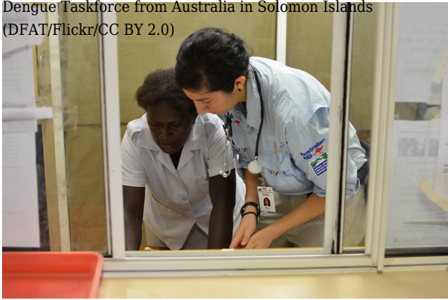
Dengue Taskforce from Australia in Solomon Islands