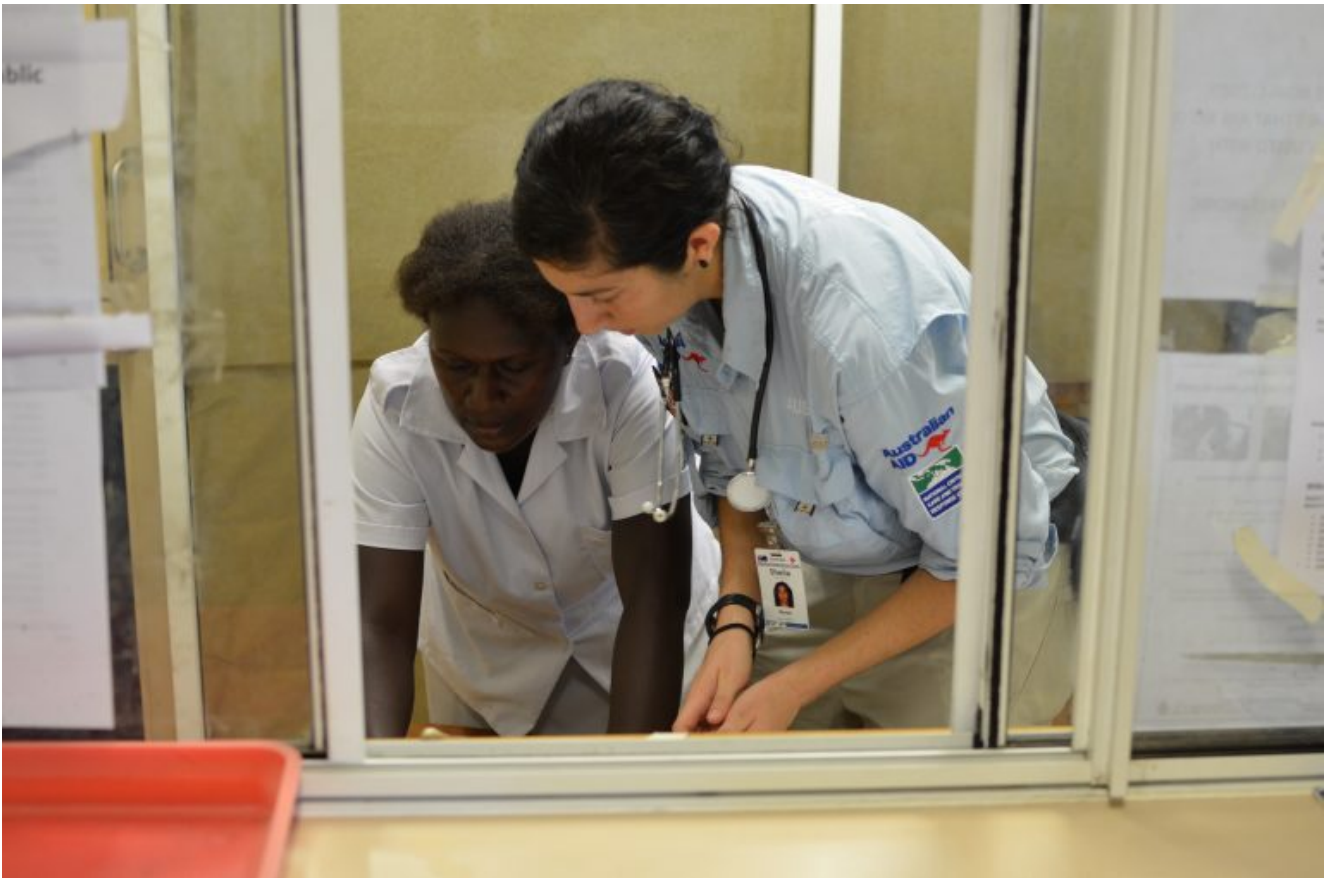
Dengue Taskforce from Australia in Solomon Islands