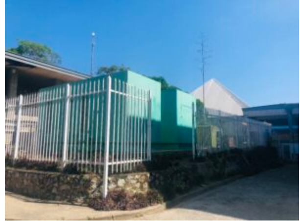
Standby generator at the University of PNG

The recent spate of power outages (70 in a week according to the Post Courier ), and the sudden resignation of yet another PNG Power Chief Executive Officer after only nine months in the job have brought into stark relief the chronic crisis that afflicts Papua New Guinea's power sector.