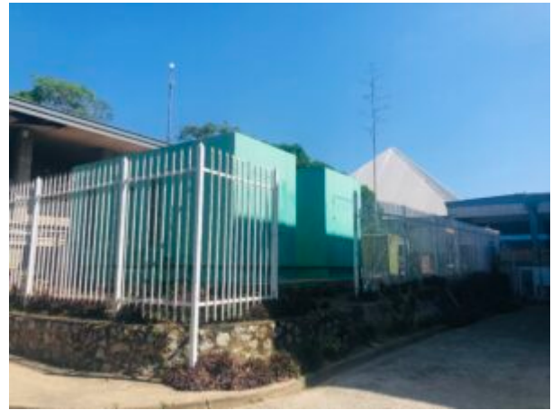
Standby generator at the University of PNG

The recent spate of power outages (70 in a week according to the Post Courier ), and the sudden resignation of yet another PNG Power Chief Executive Officer after only nine months in the job have brought into stark relief the chronic crisis that afflicts Papua New Guinea's power sector.