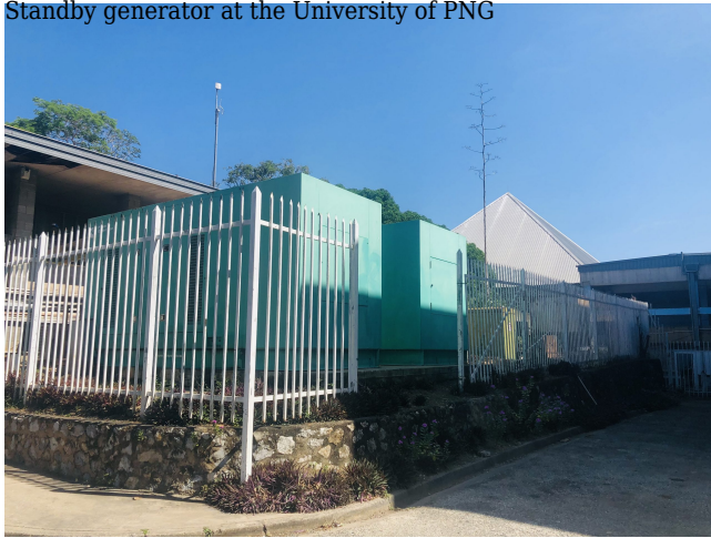
Standby generator at the University of PNG