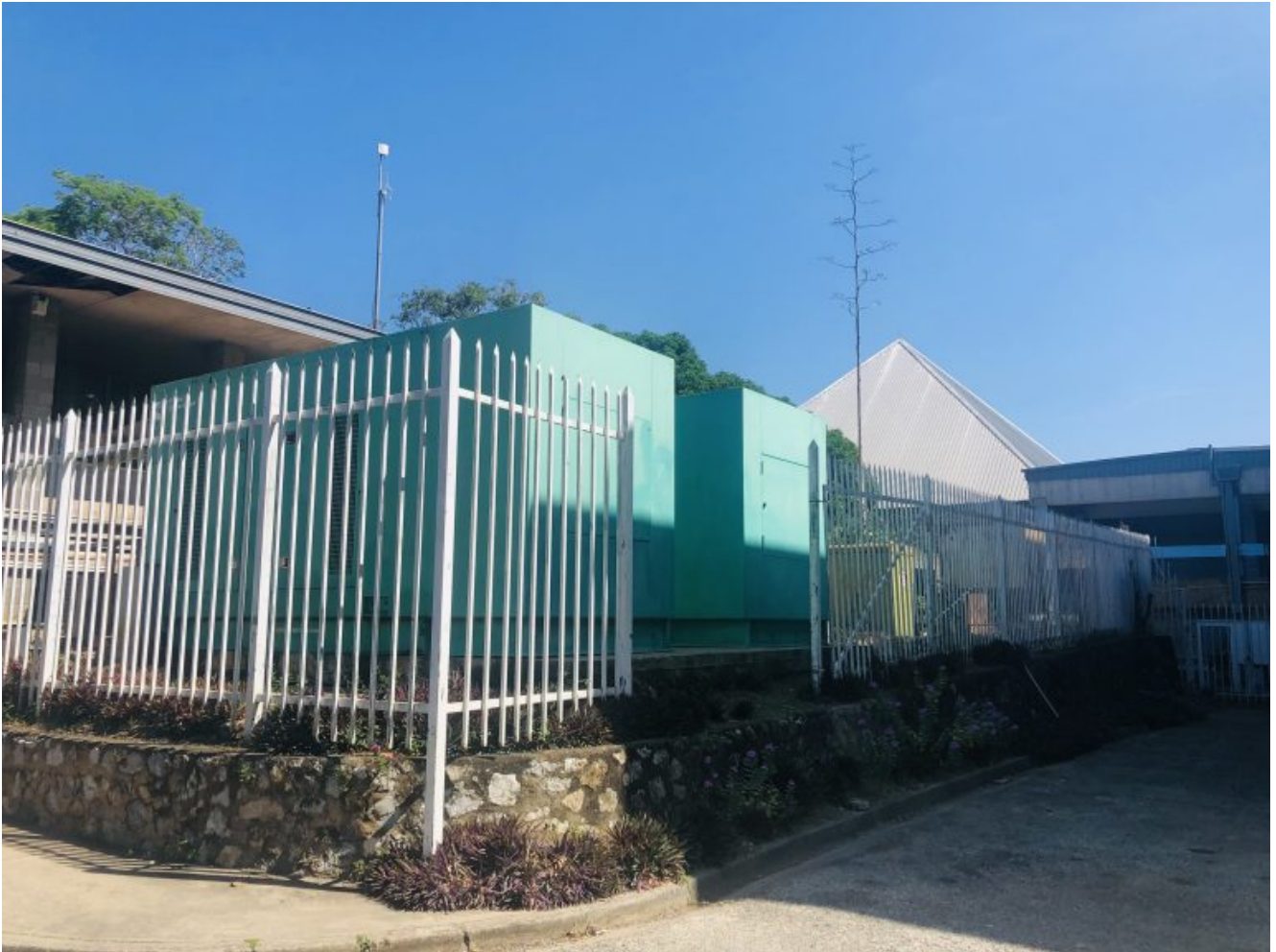
Standby generator at the University of PNG