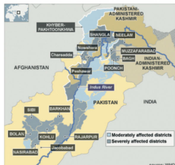
Pakistan: Flood affected areas as of February 2011

The report shows that assistance to the Pakistani population is underfunded at