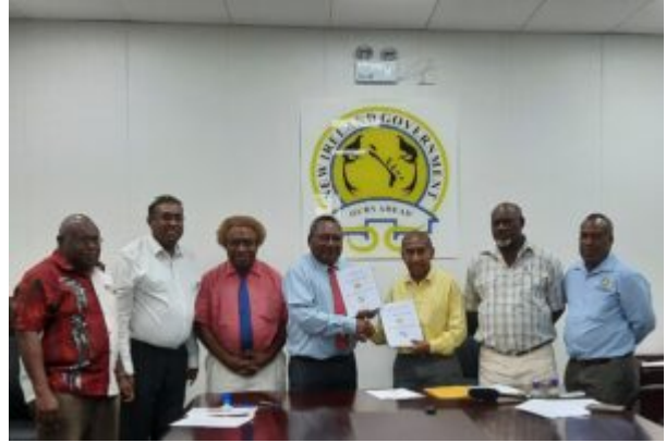
Centre for Excellence in Financial Inclusion (CEFI)

On 25 April 2023, Papua New Guinea's Centre for Excellence in Financial Inclusion (CEFI) and the Bank of Papua New Guinea (BPNG) launched the National Financial Inclusion Strategy (NFIS) 2023-2027 . The strategy is a third instalment following the 2014-2015 National Financial Inclusion and Financial Literacy Strategy and the 2016-2020 National Financial Inclusion Strategy . The two earlier strategies primarily focused on reducing PNG's significant levels of financial exclusion , which was at one stage considered to be one of the highest in both the South Pacific region and the world. Fortunately, this level has seen a sizeable reduction to somewhere between 75% and 80% , owing to the ongoing efforts and leadership of BPNG and CEFI.