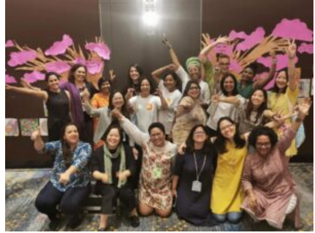
Representatives at the Revolutionising Philanthropy convergence

Have you ever wondered what the term Asia-Pacific denotes? A vast stretch of geographical land masses across Asia and the Pacific gathered into one grouping, or is the Pacific a token inclusion, where the 'P' is silent? Examining data, papers, and policies made for the Asia-Pacific region would have you believe that. As a result, across political discourse, media debates and public discussions, a new developmental and geopolitical need is being voiced – which has been amplified by an even fiercer feminist call – to be known as the Pacific region, with a distinct identity and voice from Asia.