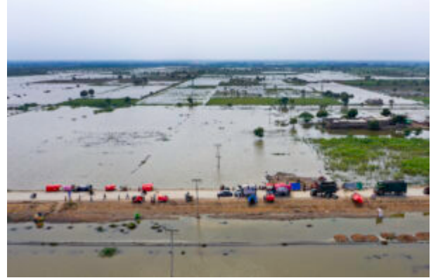
Flooding in Pakistan, September 2022