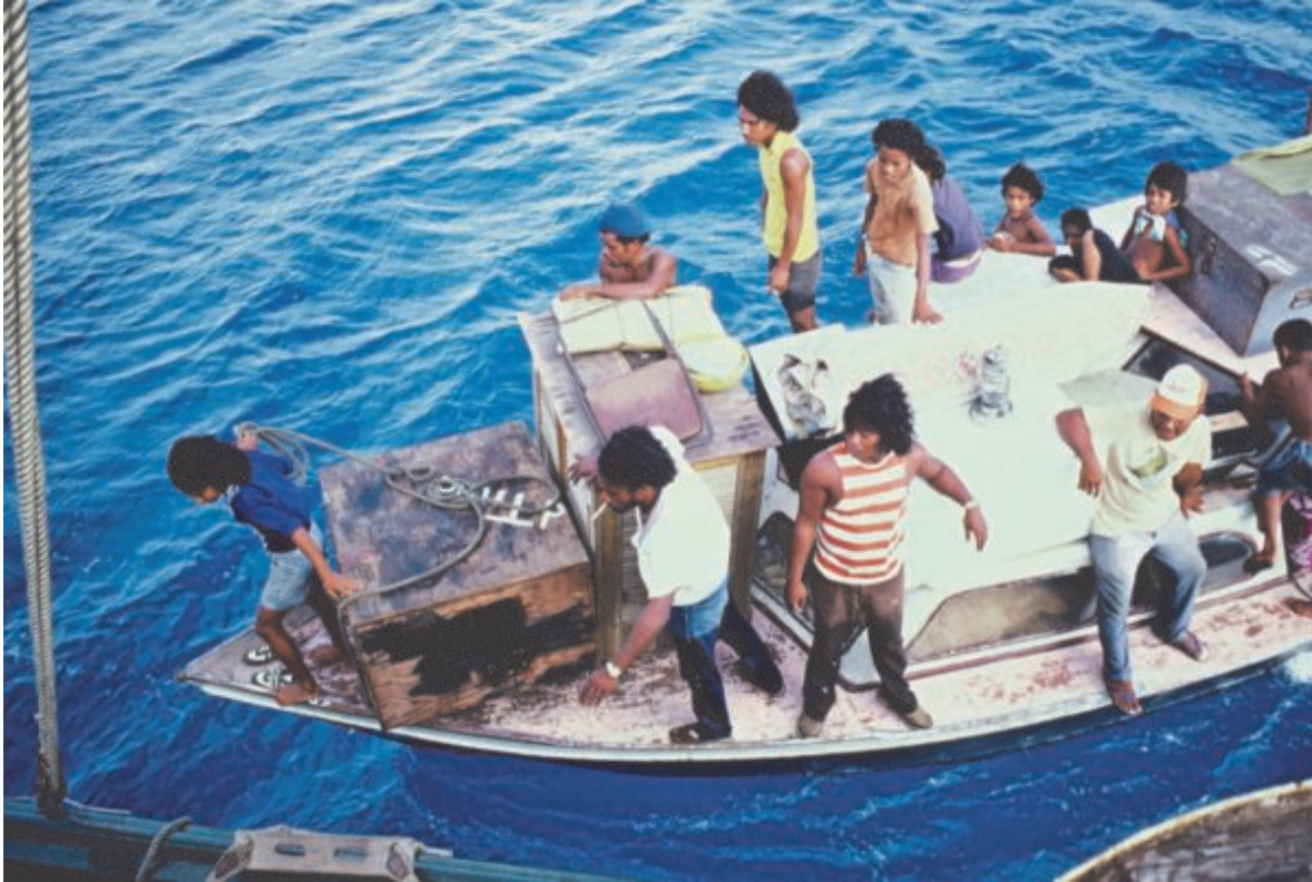
Nuclear refugees from Rongelap ferrying their demolished homes to the Rainbow Warrior for the voyage to a new home on Mejatto island in May 1985.

With regard to the present-day environmental threat of climate change, it is essential to address the lack of an officially recognised category for “climate refugee” under international law. It is also important to seek an international framework, convention, protocol and specific guidelines that can provide protection and assistance for people crossing international borders because of climate change. The existing rights guaranteed refugees — specifically the right to international humanitarian assistance and the right of return — must be extended to climate refugees. This issue should be acted on by the PIF with the Australian and New Zealand governments.