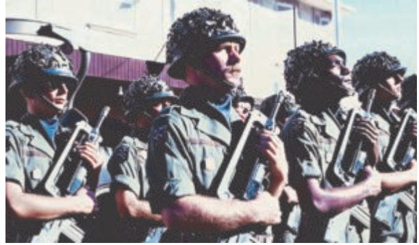
French Pacific Regiment troops at a Bastille Day parade in Nouméa, New Caledonia, 1985