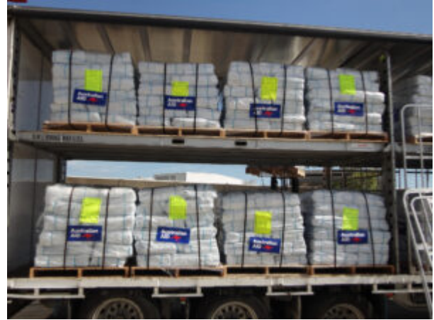
Australian aid supplies

The role of the private sector in development has been hotly contested since the private sector first became engaged in development. In recent years in Australia the situation has become particularly acute, with revelations that just ten companies now manage close to 20% of the aid budget. The development NGO community and other groups are quick to criticise.