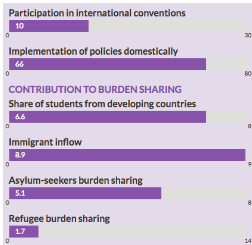
Figure 1: Components of the CDI’s migration policy sub-index (with Australia’s 2015 scores)

The last two components—relating to asylum-seekers and refugees—constitute the humanitarian lens as interpreted by CGD. Australia’s score on each component in the previous assessment from 2015 is shown in white on the left-hand side of the