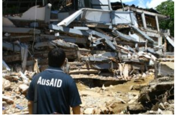
AusAID response to the 2009 Padang earthquake, Indonesia.