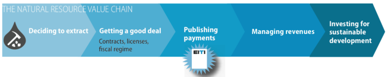
Figure 2: the natural resource value chain

The report also highlights the lack of any detailed theory of change (causality chain) that can explain how the EITI will contribute to societal transformations. EITI is an important reform but it is only one "piece in the puzzle" of converting natural resources into reduced poverty.