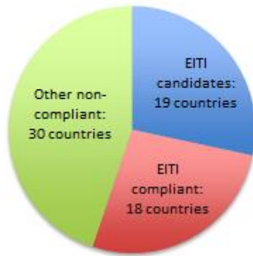
EITI compliance by number of countries