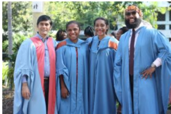
UPNG graduates, 2018