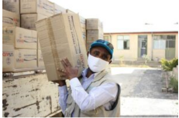
USAID worker in Tigray, July 2021