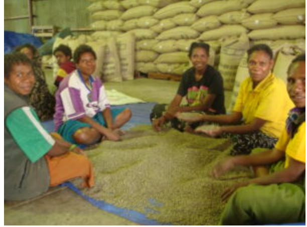
Sorting coffee beans in the PNG Highlands

PNG's general elections, conducted at 5-year intervals, tend to coincide with a decline in exports of coffee, an important cash crop. For example, PNG exported 20,000 tonnes of coffee last year, 5,000 tonnes less than the previous year. To put this decline into perspective, a reduction of 5,000 tonnes in coffee exports is equivalent to rendering nearly 43,750 acres of coffee farmlands unproductive in a single year.