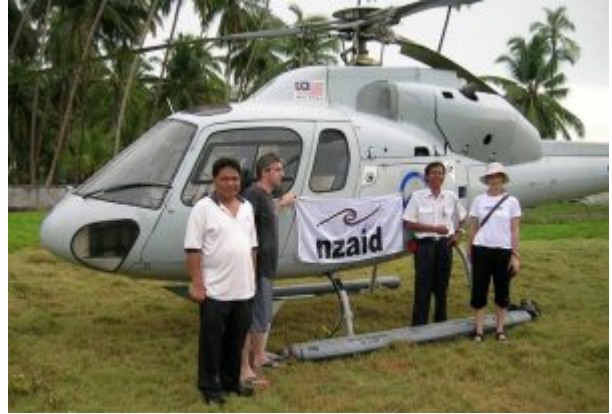
New Zealand Aid funded helicopter in Sirombu