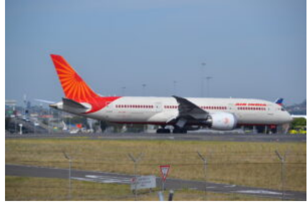
Air India aeroplane at Sydney Airport

Some people look at the coverage of the COVID crisis in India and the situation confronting their fellow Australians and exclaim, “How awful, we should do everything we can to bring them back”. Others, not so generous, exclaim “They’ve had a year to come back, why didn’t they?!”