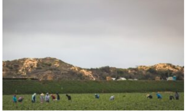
Temporary migrant workers make up the bulk of the seasonal workforce on farms in developed countries