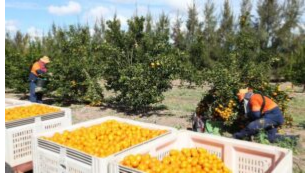
Many Tongan SWP workers work to support citrus growers