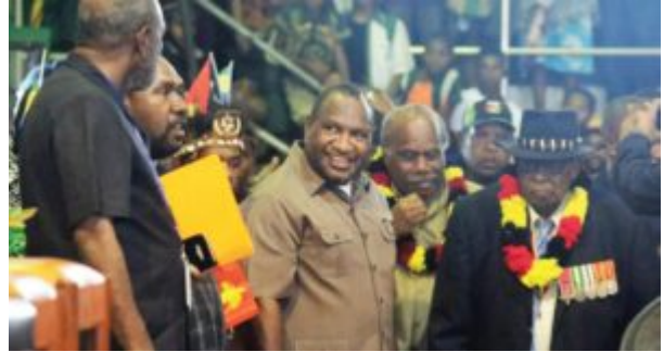
Marape attends celebrations for the 52nd anniversary of the Pangu Party, Lae