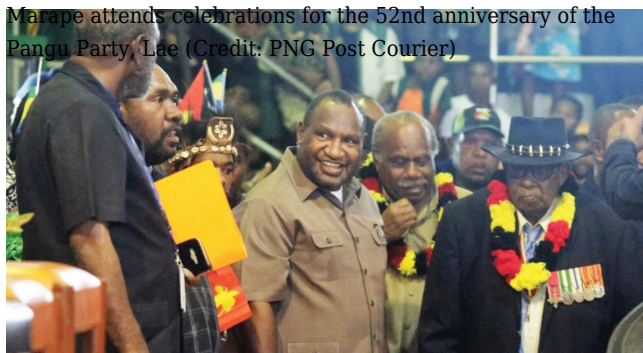
Marape attends celebrations for the 52nd anniversary of the Pangu Party, Lee