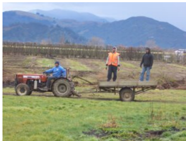
RSE workers in New Zealand

By late May 2022, as the peak harvest period for New Zealand apples and kiwifruit came to an end, and winter pruning of kiwifruit and grape vines commenced, approximately 12,200 workers were onshore under the Recognised Seasonal Employer (RSE) scheme (Figure 1). This is almost double the number usually found at this time during a 'normal' year of RSE recruitment.