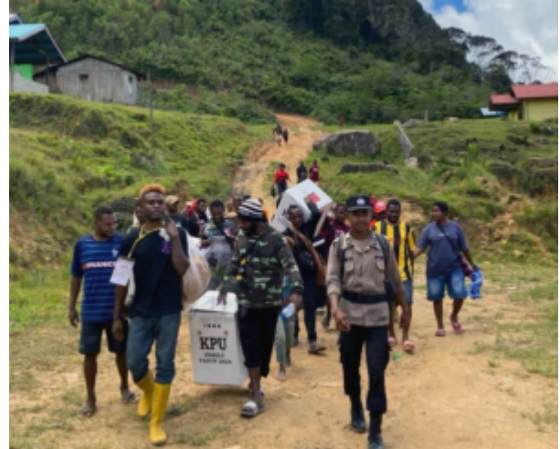
Monitoring and securing the 2024 election vote in Arfak Mountains Regency, West Papua Province