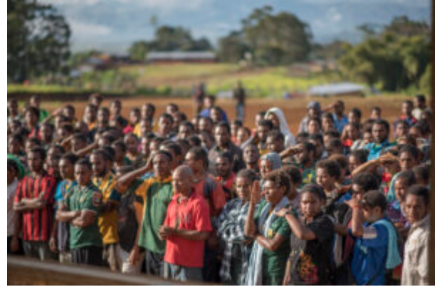
Students at the Kumbareta School run by Oaktree and Baptist Union, 2015

Hip hop performances, rousing speeches, face painting and smiles created an energetic atmosphere at the International Youth Day Celebrations held in August in Port Moresby. The celebrations brought many organisations together to support the youth-led Sanap Wantaim , or Stand Together campaign, to end violence against women in the city. The vibrancy, ingenuity and intelligence of Papua New Guinea's young people was on full display.